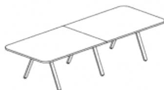
Conference Two-Piece Top

D: 48, 54, 60 W: 108, 120, 132, 144, 156, 168, 180, 192 H: 29.5, 36, 42