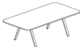
Conference One-Piece Top