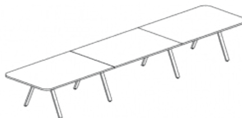
Conference Three-Piece Top

D: 48, 54, 60 W: 108, 120, 132, 144, 156, 168, 180, 192 H: 29.5, 36, 42